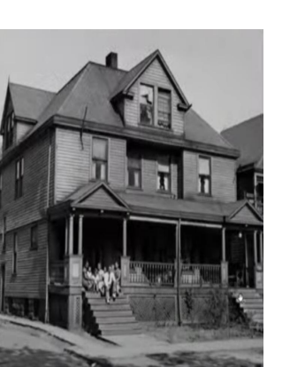
1922 - Owens family moves to Cleveland 1926 - Owens family lives on E. 90<sup>th</sup> Street 1930 - Owens family lives on E. 95<sup>th</sup> Street • 1934 - Owens family lives at 2178 E. 100th